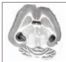
Perform quantitative receptor autoradiography.

Samples larger than any given screen can be exposed to two screens in the same film cassette, scanned, and then stitched together with OptiQuant software.